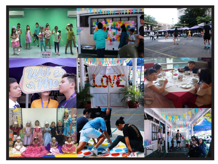
The School Spirit Week activities unify students, teachers, and staff, and promote school pride.

The events helped create in an innovative way a stronger, more unified community at SISC. Students are shown, rather than told, why they should take pride in their school while