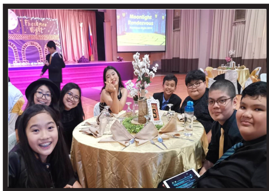
The Grade 7 students mingle and bond during Freshmen Night.

The SISC High School Class of 2025 got a taste of the next six years with the annual Freshmen Night taking place last August 20, 2019 at Luxembourg Hall. Each year, the SISC Student Council invites freshmen to the evening event to provide a smooth transition from Grade 6 to Grade 7. They were treated to presentations of what high school life would entail, musical numbers, dinner, and games to take some of the anxiousness out of the start of high school