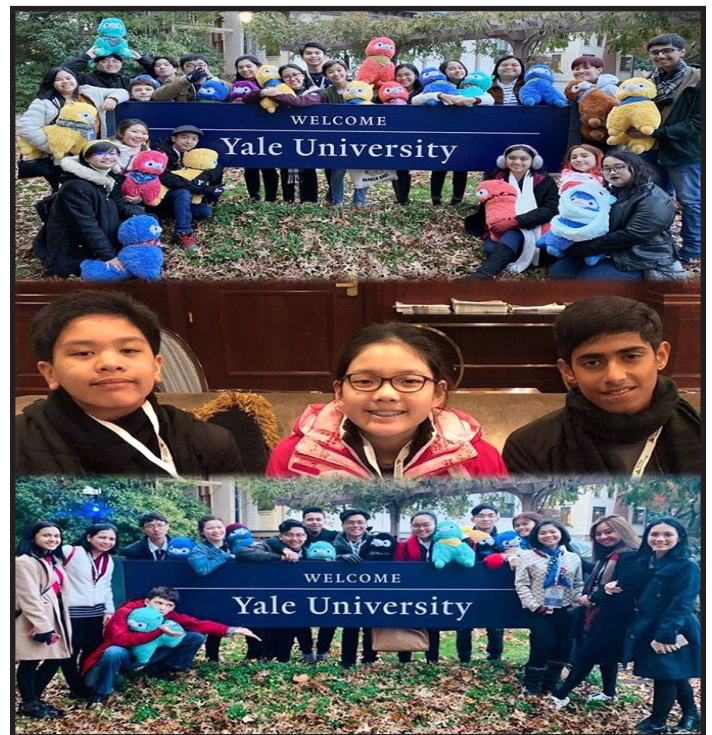
The SISC Monarchs conquer the Yale challenge.