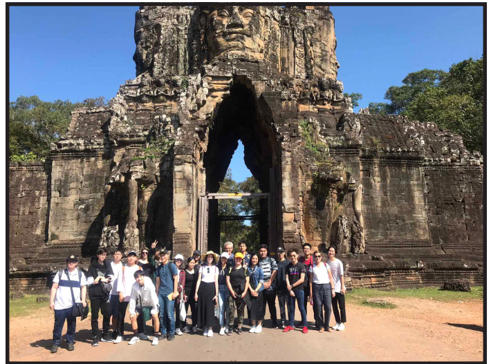
The SISC IB contingent tours Cambodian Temples.

The CAS Trip not only introduced the students to a new culture but also developed their consciousness as young global