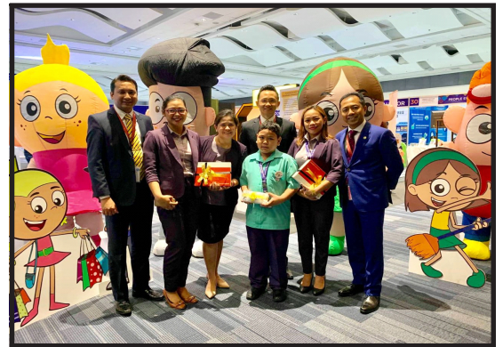
The SISC Grade School Financial Literacy contingent receives their awards from the event organizers.