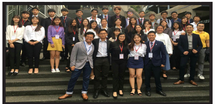
The SISC MUN delegates develop an awareness of the workings of the United Nations and the countries they represent.

The conference was participated by more than 200 students from international and prestigious private schools namely, Southville International School and Colleges, British School Manila, Chinese International, School Manila, DLSU Integrated