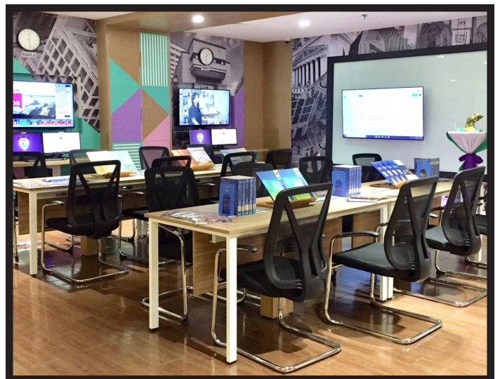
The SISC Financial Lab provides an interactive introduction to the stock market.

The Financial Lab, located on the fifth floor of the High School