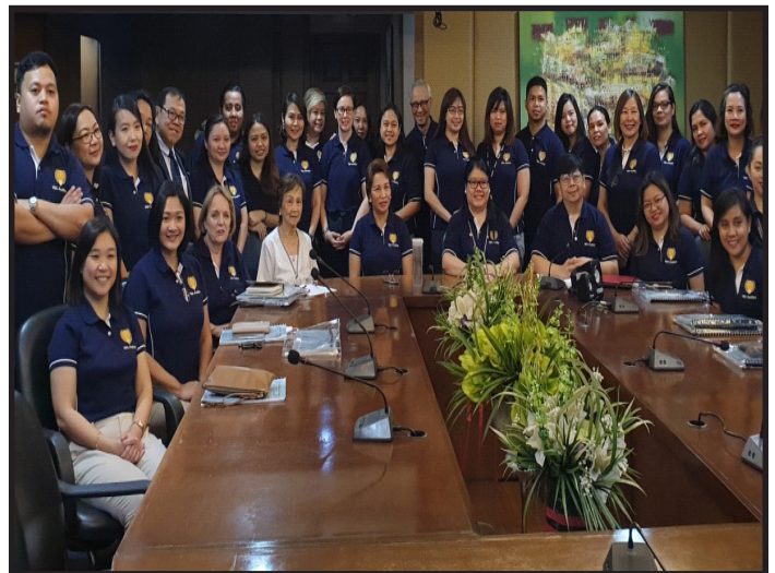
The internal auditors gather for the IQA opening meeting.

ISO-trained IQA auditors from the school assessed thoroughly all aspects of SISC's operation: curriculum, teaching, academic management, administration, finance, safety and security, public relations, feedback and complaint procedures, etc. The auditees will then receive feedback including points of excellence, recommendations, and requirements which must be implemented within a set time frame.