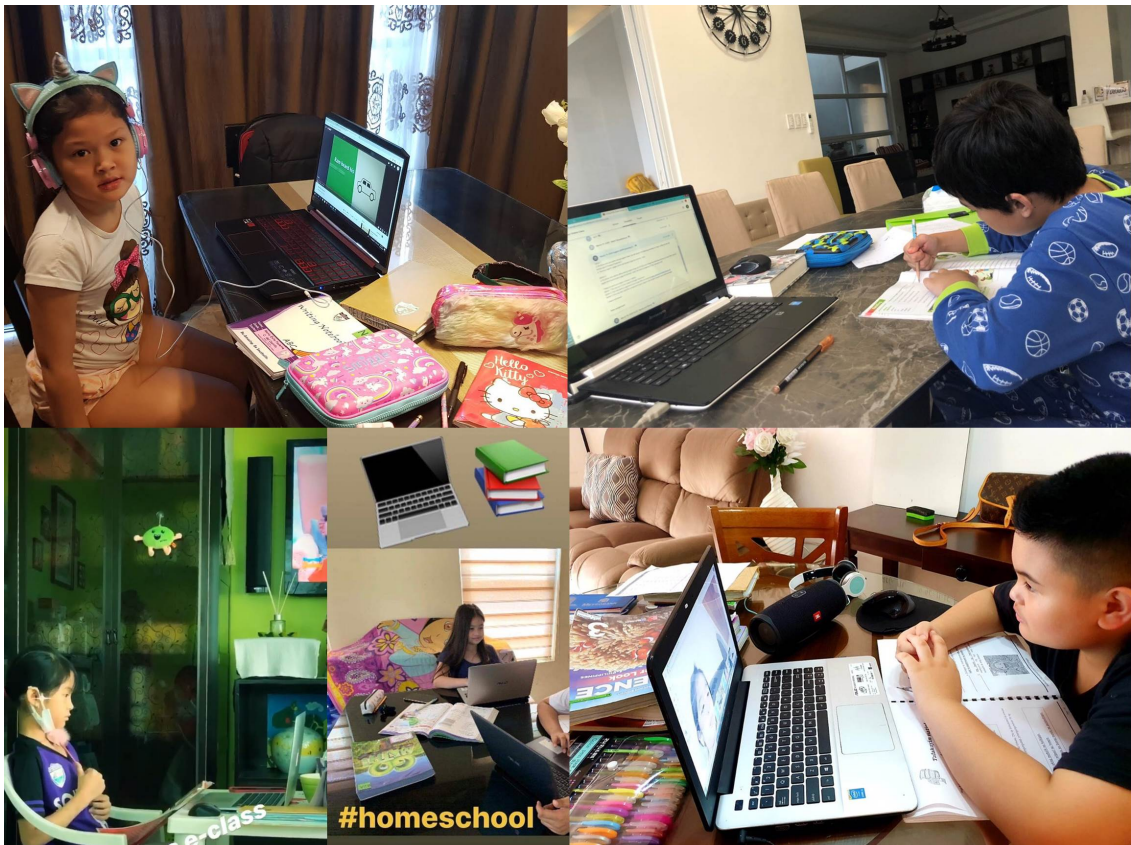
Grade schoolers do independent study after their online class with their subject teachers.