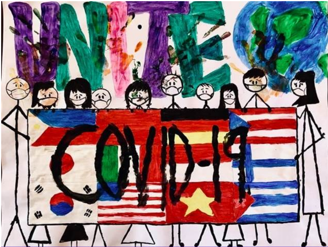
Grade schoolers make posters in Art Class to show their support to flatten the curve.