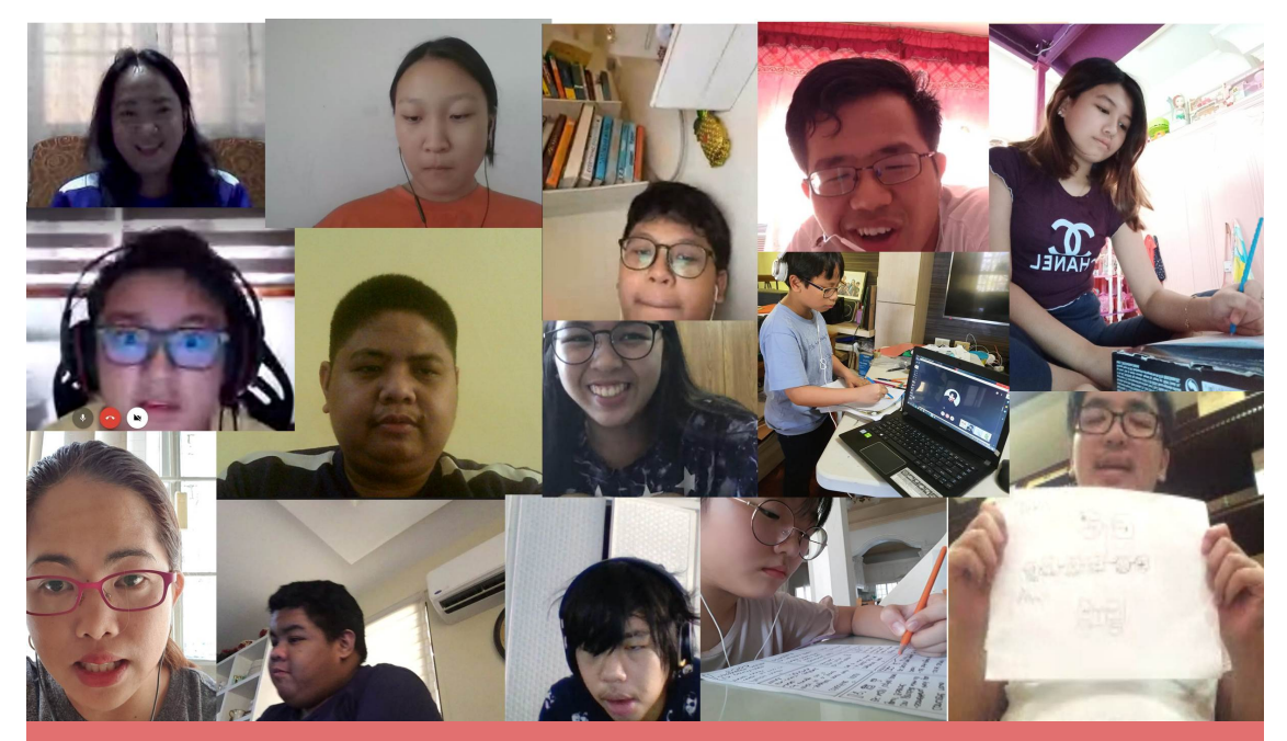
Photos above: High School students and teachers foster connection through classroom routines.