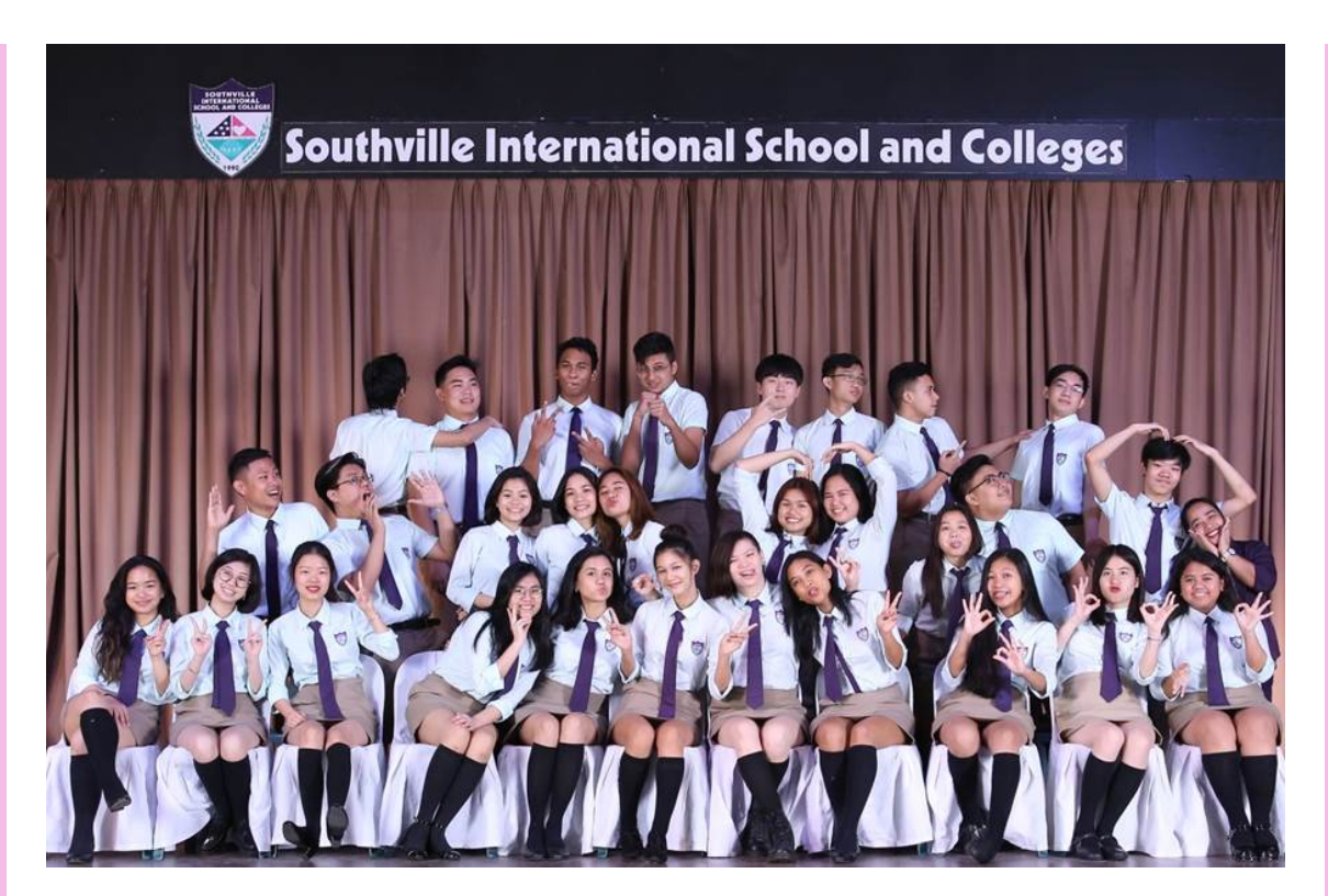
Congratulations to Class 2020!