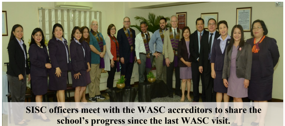
SISC officers meet with the WASC accreditors to share the school's progress since the last WASC visit.

accreditation. In May 2018, WASC announced that it had granted a six-year accreditation term to SISC with a mid-term visit in 2020. The accreditation ensures that the school had been reviewed and critiqued to provide the highest-