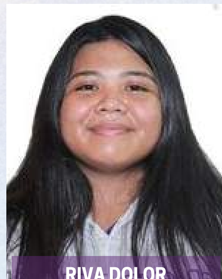
RIVA DOLOR LACDAO 12 - SERVICE (ABM)