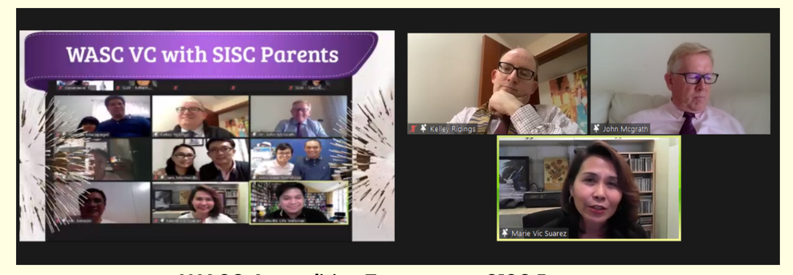
WASC Accrediting Team meets SISC Parents.