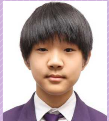
Cho Woo Sung 10 Commitment