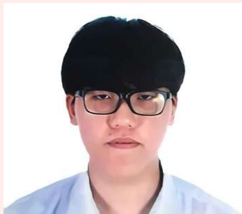
Park Insu 12 Grit