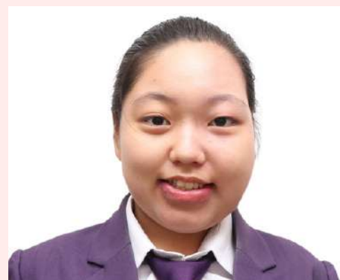
Park Seojeong IB 1 Inquirers