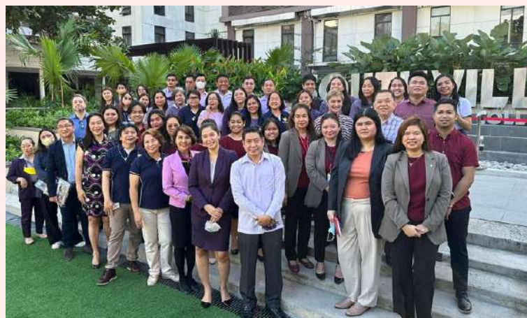
IQA Auditors and Trainees during the opening meeting