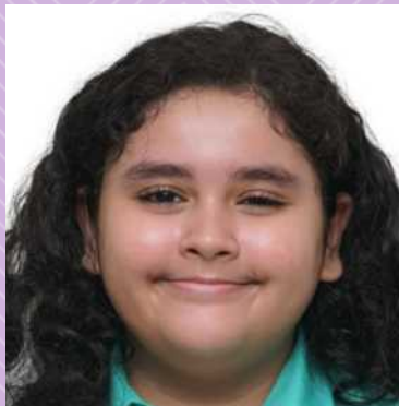
Prince Iago Kumar 6 - Perseverance