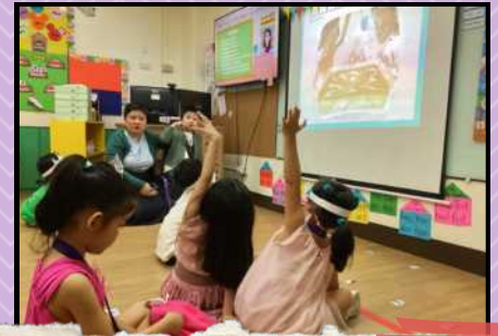
STAR Campus School Spirit Week