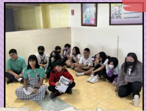
Munich Campus Speak English Drive Launching