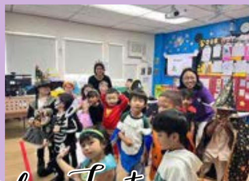
STAR Campus Multi Day - Trick or Treat