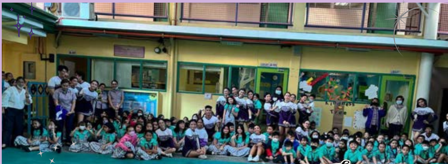
SISC Pep Squad visits Young Monarchs of STAR Campus