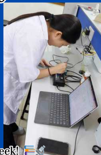
IB students in action during Internal Assessment Week! 🇧🇪 🇸🇮

Unleashing creativity through experiments, making every discovery count.