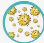
Microorganisms (Bacteria, viruses, and fungi)