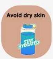
Avoid dry skin