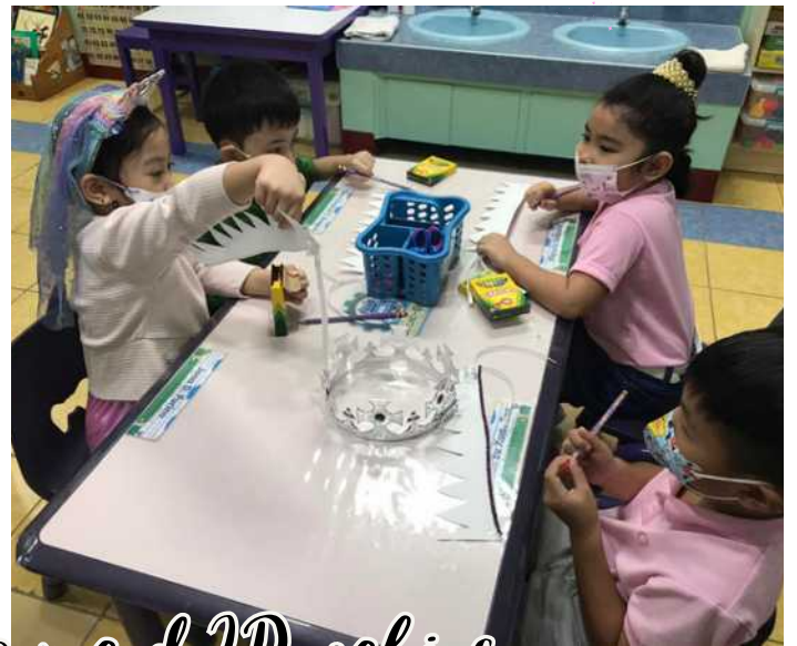
Munich Campus Crown and ID making