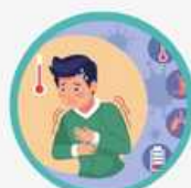
Weakened immune system