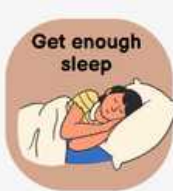
Get enough sleep