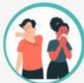
Contact with environmental triggers such as allergen or another person's skin