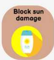
Block sun damage