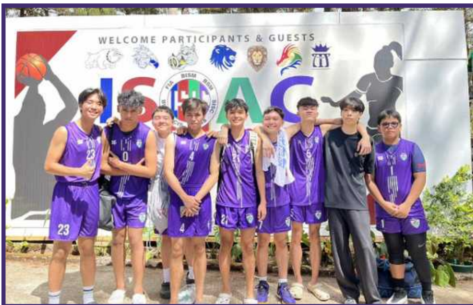
Basketball Boys 6th Place