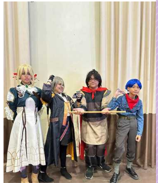
High schoolers letting their inner weeb shine during the STEM week, slaying their anime cosplay game!