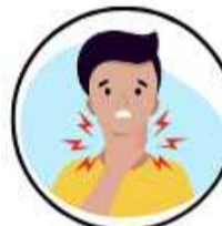
Difficulty in Breathing