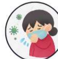
Whooping Sound after Coughing

Infants may not cough but may have trouble in breathing or experience a pause in breathing .