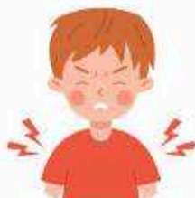
Muscle aches or pain