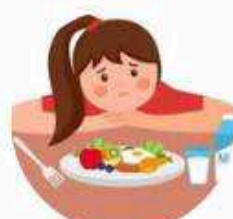
Loss of appetite