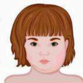
Child with mumps

MUMPS IS CAUSED BY A VIRUS, SO IT CANNOT BE TREATED WITH ANTIBIOTICS. ANTIBIOTIC WORK ONLY AGAINST BACTERIA.