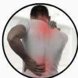
Core muscle weakness