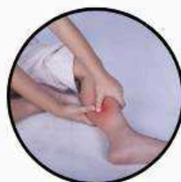
Leg pain, numbness or weakness