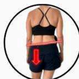
Uneven waist and Elevated hips