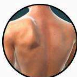
Shoulder blades that stick out