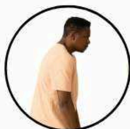
Difficulty standing upright