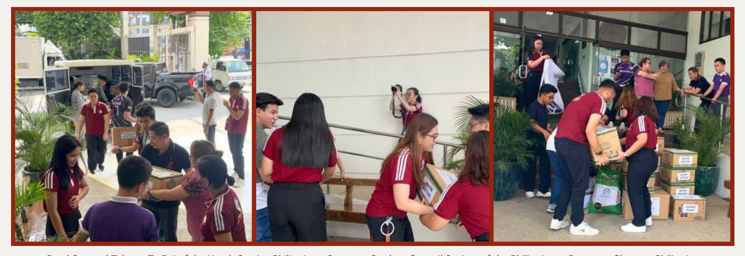
PsychSoc and Tabang Ta Bai of the Youth Service Philippines, Supreme Student Council Society of the Philippines - Batangas Chapter, Philippine AirForce Civil-Military Operations Group (PAFCMOG), and the Philippine Air Force Air Education and Training Command (AETDC) work hand-in-hand to ensure the safe delivery of the donations to its recipients.

It was truly a heartwarming moment to witness the handing over of the packed goods to the air force, and to see the pleased smiles on the faces of the volunteers from both sides. The spirit of giving was evident as everyone worked hand in hand to load the packages into the vehicle, definitely showcasing our Filipino value of bayanihan as they worked together to be able to help a community in need.