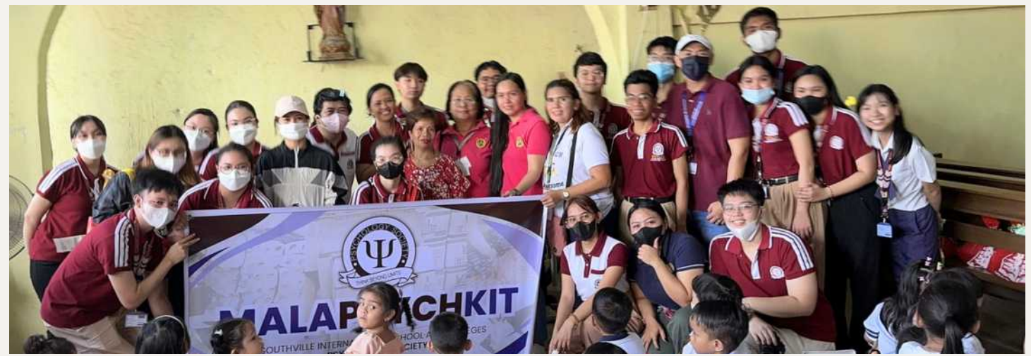
The students, professors, and the Dean of the College of Psychology along with the class advisers of the preschoolers from CAA.

The gifts and sponsors did not end there. There was also a kind benefactor who ensured that this program extended beyond gifts and feasts. This compassionate supporter donated sets of colored pencils that ensured that not only will the hearts and the stomachs of children be filled this Christmas, but also their minds.