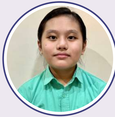
Gabriel Dino Gold Award