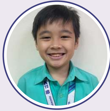
Franco Prepeña Merit Award