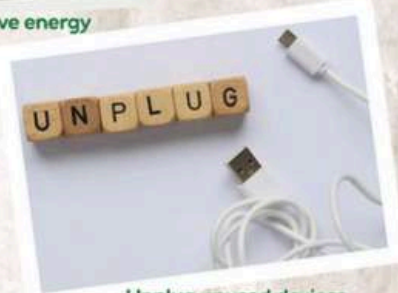
Unplug unused devices