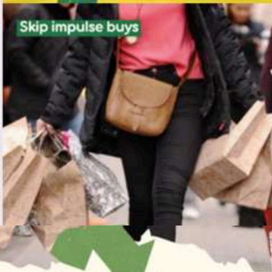
Skip impulse buys