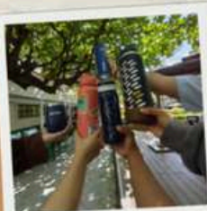
BYO Bring Your Own Water Bottle water bottle