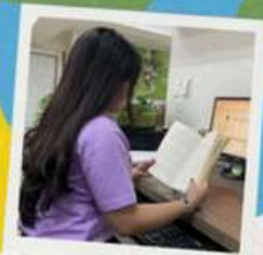
Reduce screen time

Saving energy also means caring for yourself.