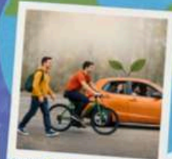
Walk, Bike and Carpool when possible

“Lower your carbon, lighten your footprint.”