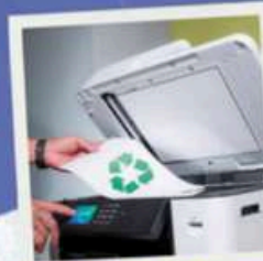
Only print what you need