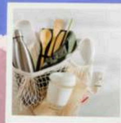
Zero Waste Kit