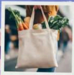
Use of Reusable Bags when Shopping