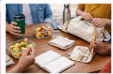
Sustainability at the Table