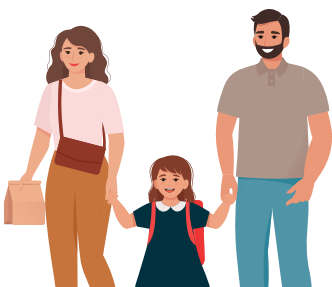
GRADE 4 HOPE WITH T. CESS