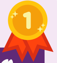
KYRENE RAE AGAPITO Grade 1 Galileo