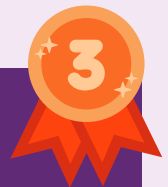
LIGHT PARIN Grade 1 Galileo