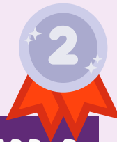
DIANA YSABELLE PACULA Grade 1 Galileo